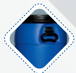
Ring Customization (Plastic / MS)