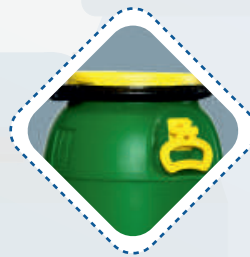
Accessories Colour Customization