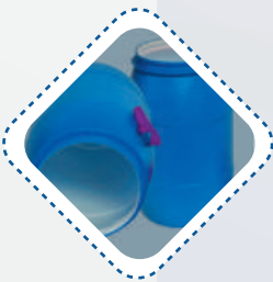
Twin Layer with Colour Customization