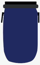
Full Open Top